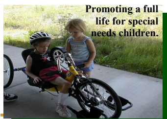
Promoting a full life for special needs children.