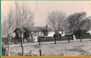
de Groot Family Farm

My parents' faith in God... and their insistence that human and religious values are paramount, all had a profound effect on me.